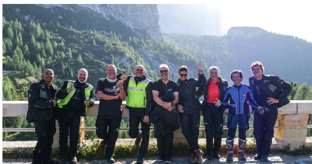
Day 2: Milan to St. Moritz – 190 km / 118 miles (Hotel included, morning motorcycle pickup)

Let's hit the road towards Switzerland! We'll begin by taking in the breathtaking views of Lake Como, with its iconic villas and crystal-clear waters. After crossing the Swiss border, we'll pass through the scenic Maloja Pass before reaching the glamorous resort town of St. Moritz, where we'll spend the night in this luxury alpine setting.