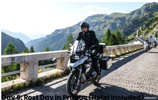
Day 6: Rest Day in Prague (Hotel included) NIKKASIT

Enjoy a free day to discover Munich's treasures! Hop on a tourist bus or stroll around to see iconic sights like the Marienplatz, the English Garden, and the majestic Nymphenburg Palace. Whether you're exploring the historic center or enjoying a beer at a local beer garden, Munich has something special for everyone.